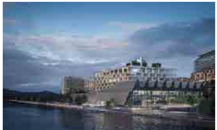
Future headquarters of BNP Paribas Real Estate, Métal 57.

Métal 57 is the perfect example of the circular economy in practise, with bricks from the existing building to be used in a mural for the inside passageway and a real and lasting commitment to sustainability and the planet. The objective is to obtain such environmental certifications as HQE and BREEAM in order to demonstrate that this commitment goes far beyond just the building itself. ■